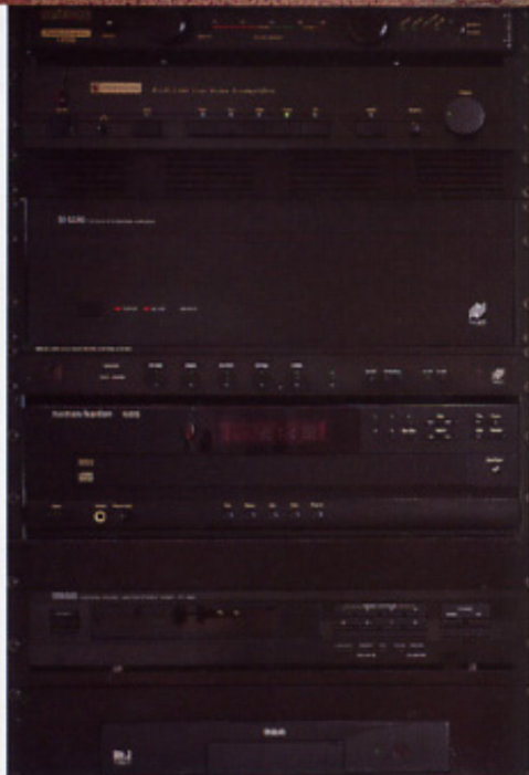
The gear for the whole-house audio system finds a home in an unused cupboard in the kitchen.