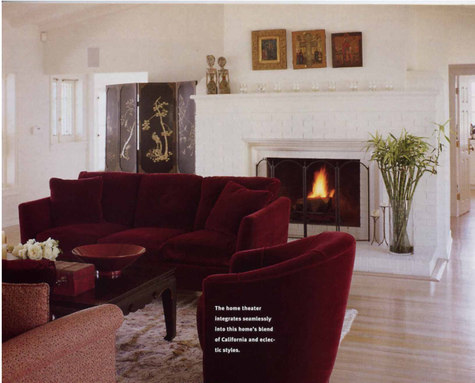
The home theater integrates seamlessly into this home's blend of California and eclectic styles.